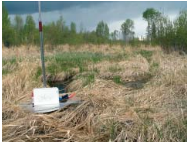
Fuel load of 6.0–6.99 t/ha