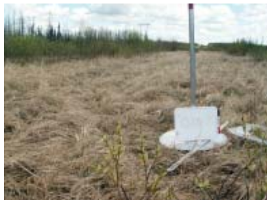
Figure 1. The disc meter that was used to estimate fuel loads.

The mean fuel load of the 64 spring samples from 2005 was 3.47 t/ha. These samples ranged from 0.69 to 7.63 t/ha and had a standard deviation of 1.83. Mean disc height was 10.2 cm with a standard deviation of 4.7. The mean weight of the spring samples is slightly higher than the 3.0 t/ha default used in the Canadian Fire Behaviour Prediction (FBP) model (Forestry Canada Fire Danger Group 1992) to predict grass fire behaviour. Although the similarity