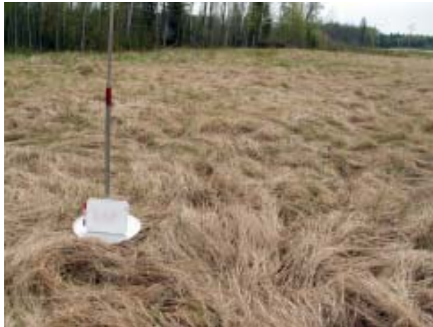
Fuel loads >7.0 t/ha (7.6 t/ha)