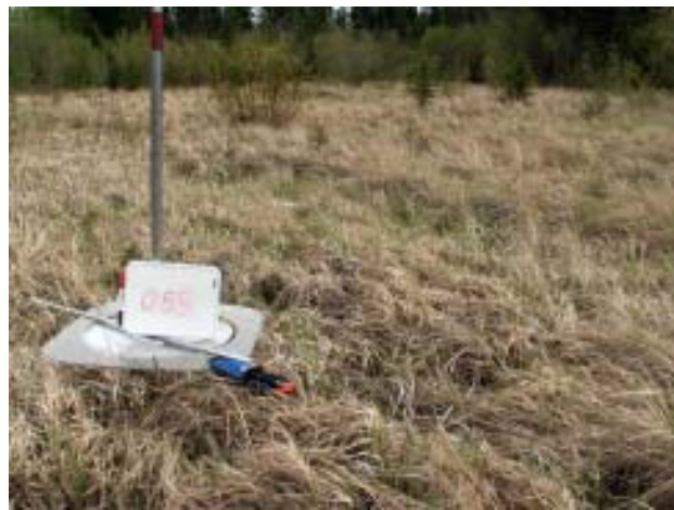
Fuel load of 4.0–4.99 t/ha