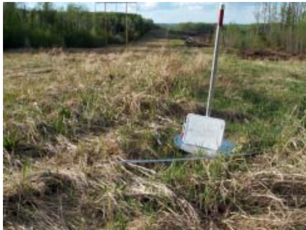
Fuel load of 3.0–3.99 t/ha