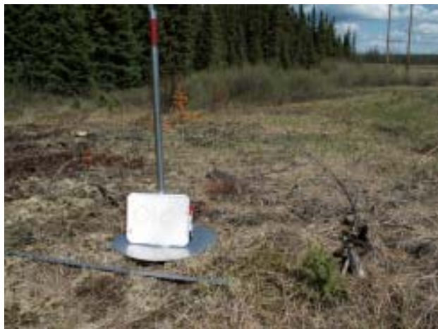
Fuel load of 1.0–1.99 t/ha