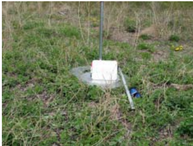
Fuel load of 0.1–0.99 t/ha