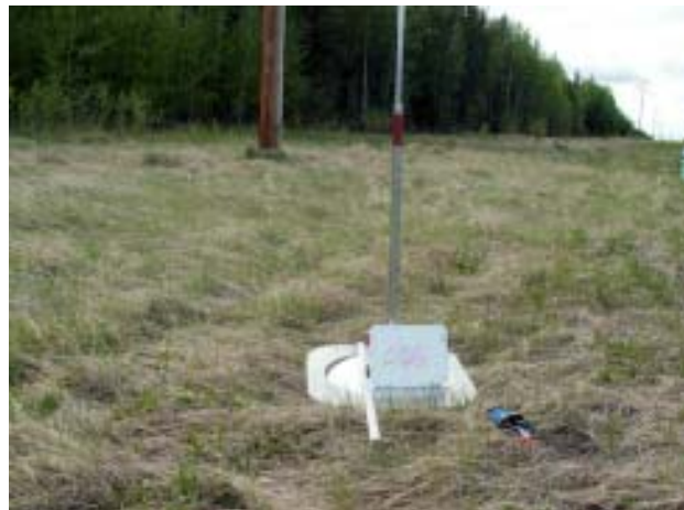
Fuel load of 2.0–2.99 t/ha