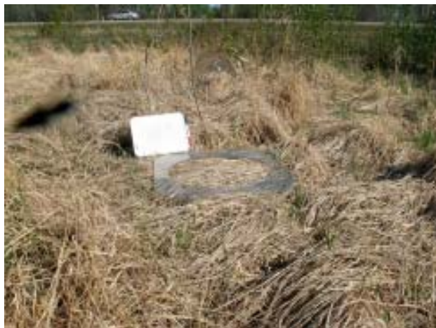
Fuel load of 5.0–5.99 t/ha